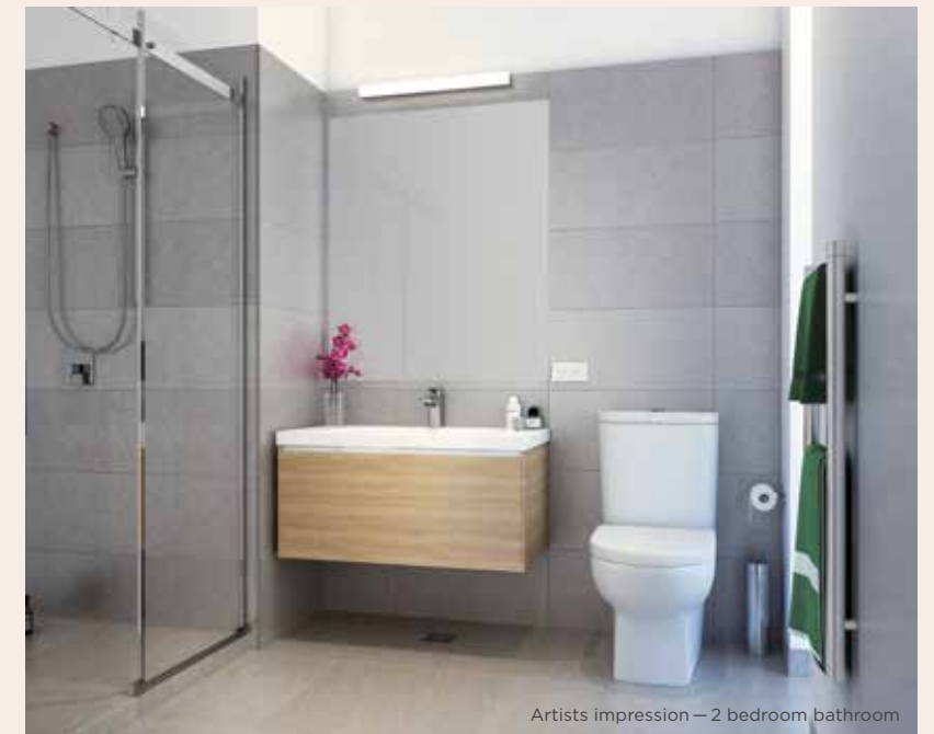
Artists impression – 2 bedroom bathroom