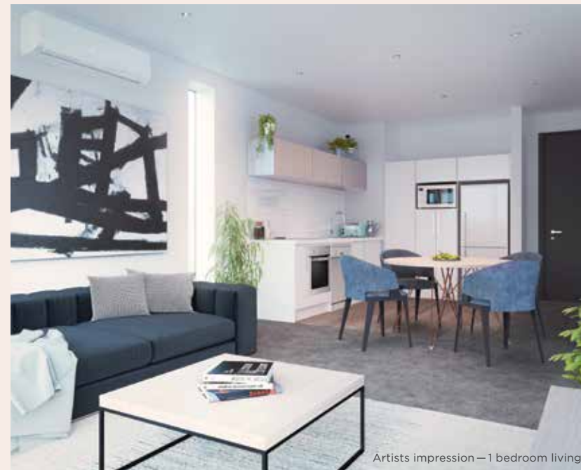
Artists impression – 1 bedroom living