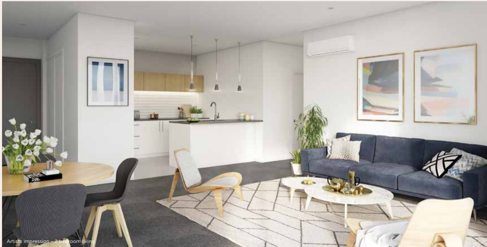
Artists impression – 2 bedroom living