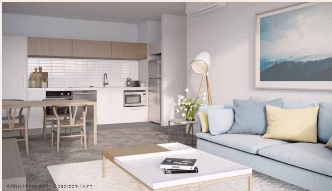
Artists impression – 2 bedroom living