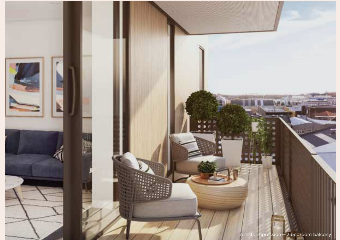
Artists impression – 2 bedroom balcony