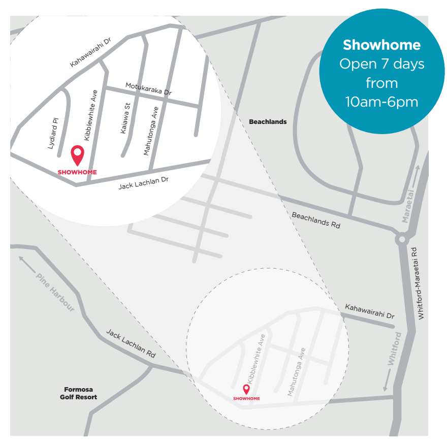
Exit the southern motorway at the East Tamaki Road off-ramp and turn left. Continue on East Tamaki Road, turn right onto Preston Road then left onto Ormiston Road. Follow the signs to Whitford and continue on Whitford-Maraetai Road. Turn left onto Jack Lachlan Drive toward Formosa then right onto Kibblewhite Avenue to our showhome.