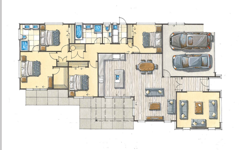
Artist's impression, minor changes may occur.

This beautiful north-facing home is perfect for summer entertaining and will capture your heart.