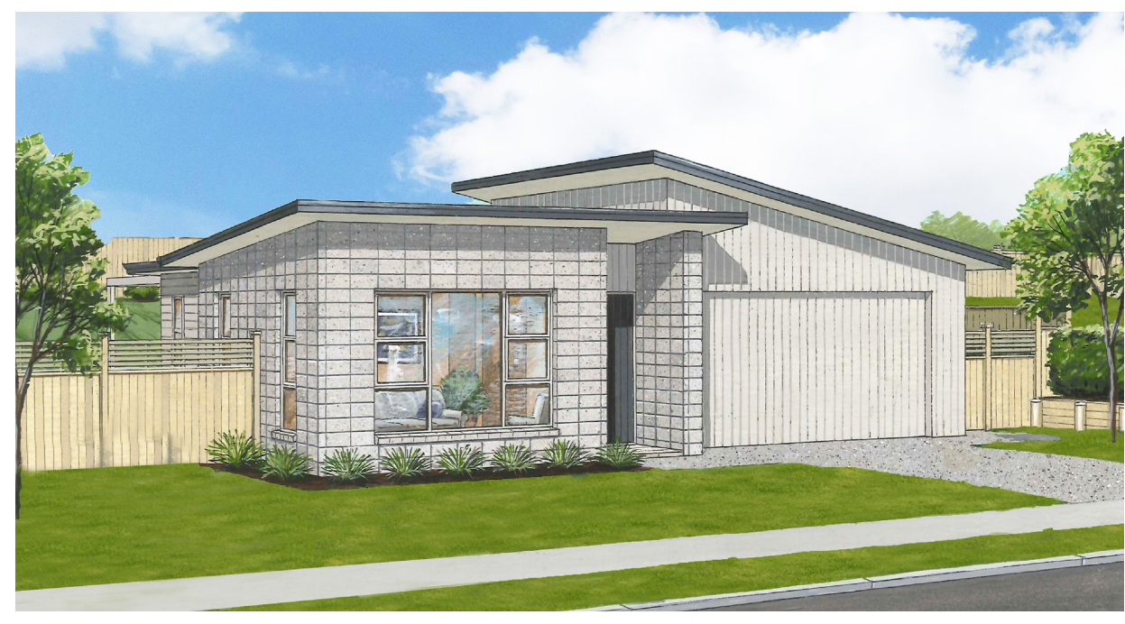
Artist's impression, minor changes may occur.

This home will be available for sale from 10am to 4pm, Saturday 23rd September 2017 on terms & conditions acceptable to the vendor.