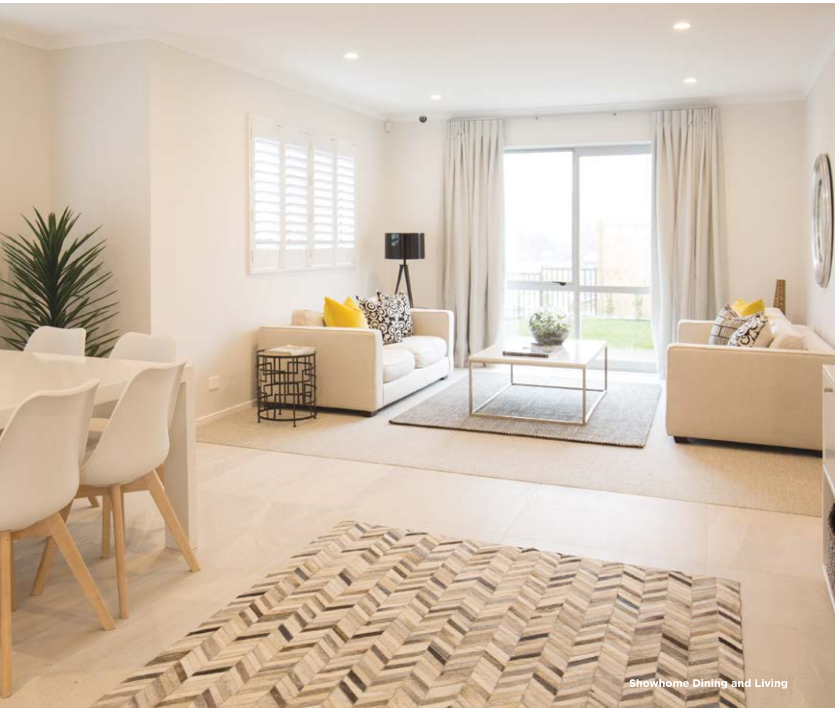
Showhome Dining and Living

The elegant, light and open spaces in these homes offer a versatility suitable for all lifestyles. Contemporary habitation is all about the open plan, where kitchen, dining and living happily coexist. It's easy to feel at home and entertain with ease. This is quality living perfect for all ages and stages.