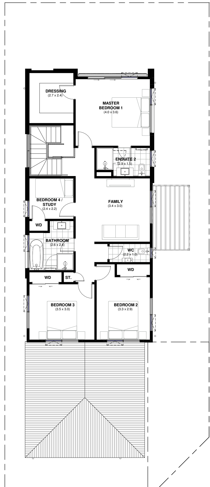
LOT 3053 - FIRST FLOOR PLAN

PLANS MAY BE SUBJECT TO CHANGE. FLOOR AREAS INDICATED IS APPROXIMATE ONLY