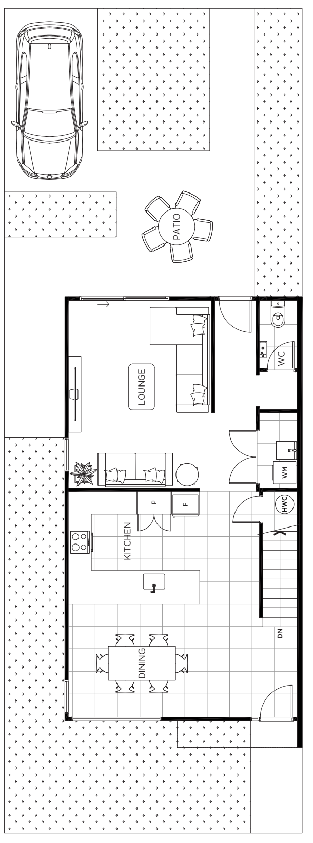
24 Bader Drive, Māngere

The specifications, details and information (including size and layout) set out on these floor plans are indicative only and may be subject to change.