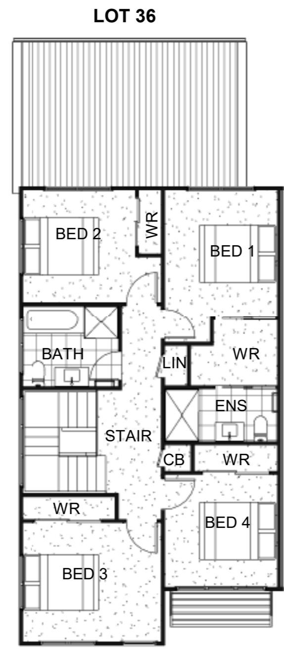
LOT 36 UPPER FLOOR PLAN 1 : 100