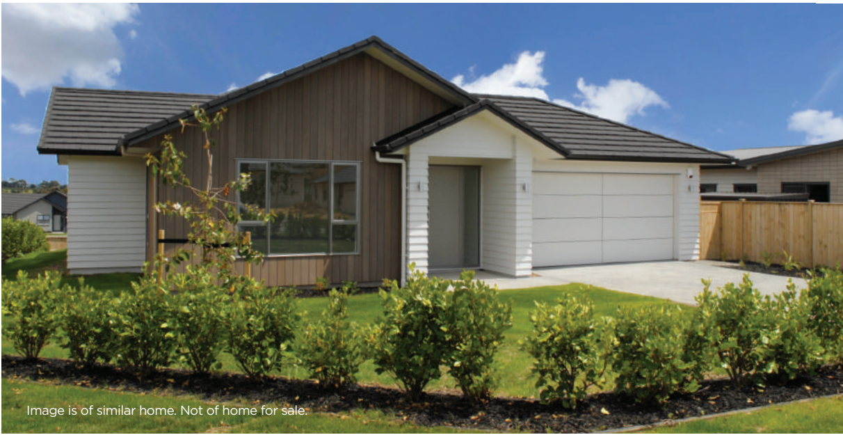
Image is of similar home. Not of home for sale.