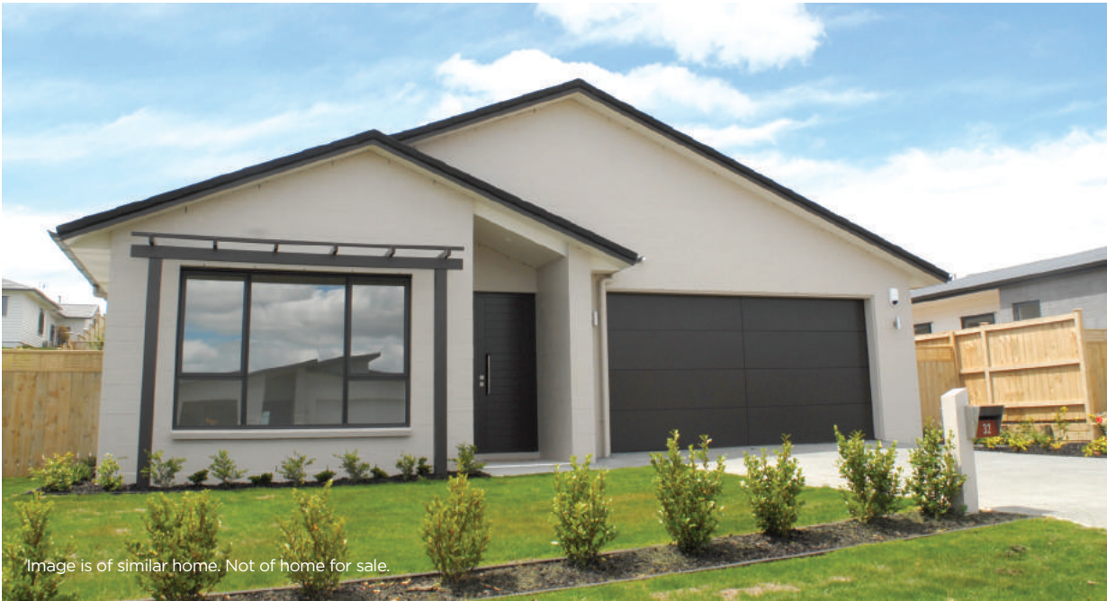
Image is of similar home. Not of home for sale.

This home will be available for sale from 10am to 4pm, Saturday 5th May 2018 on terms & conditions acceptable to the vendor.