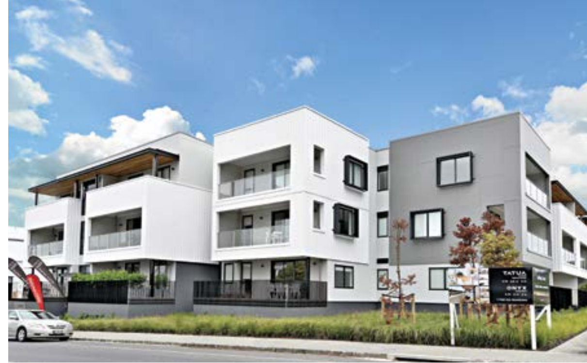
Left: Onyx apartments Middle left: Kimiora terraces rooftop deck Middle right: Kimiora terraces Bottom left: Obsidian apartments Bottom right: Onyx apartments open plan

Three Kings will see up to 1,500 homes built over the next eight to 10 years and will cater to a wide range of lifestyles and life stages. Formerly the Three Kings quarry and second largest brownfield site in Auckland, plans for this unique inner city development will see the quarry transform into a modern, connected, integrated, central city community. The development will include a town square, two playing fields, a village green and a wetland park with boardwalk. Three Kings will be well connected to the town square and will be respectful of nearby landmarks such as the Te Tātua-a-Riukiuta volcanic cone.