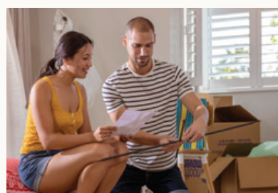
10 ways Fletcher Living makes buying your first home easy