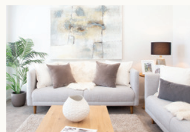
Easy living meets timeless style and sophistication