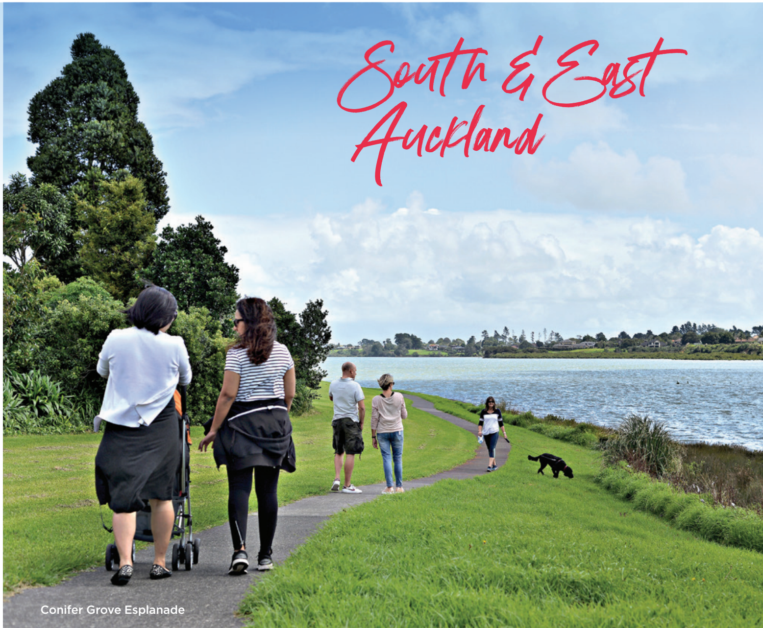
Conifer Grove Esplanade