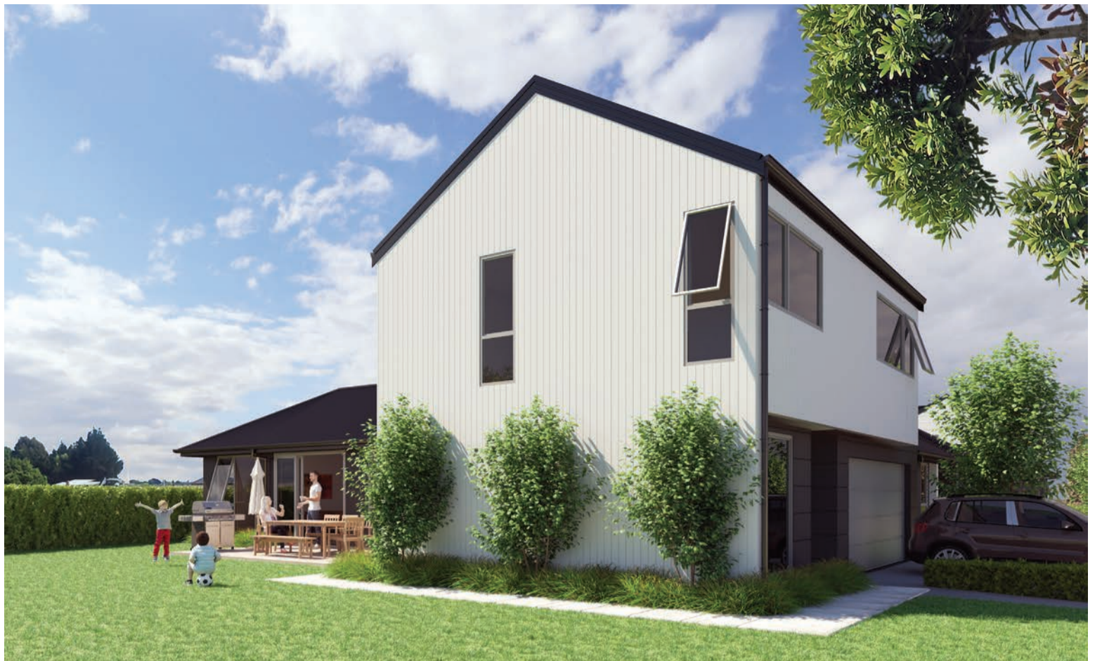
ARTIST IMPRESSION - Stand Alone Home Exterior

These homes incorporate a thoughtful blend of flooring options. Neutral colour tones have been selected to give buyers plenty of scope to add their personal style to the interior design with the addition of their own soft furnishings and furniture.