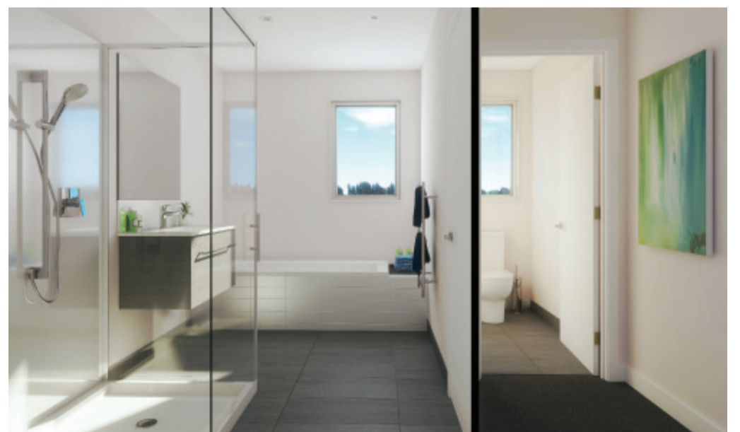
ARTIST IMPRESSION - Stand Alone Home Main Bathroom