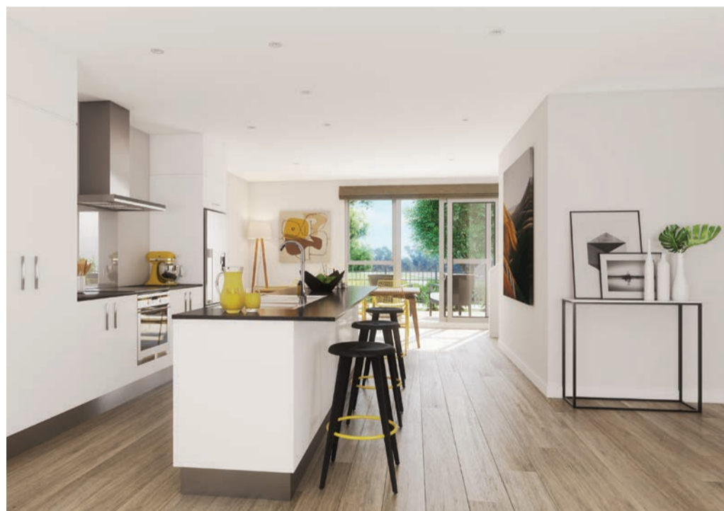
ARTIST IMPRESSION - Terrace Home Kitchen