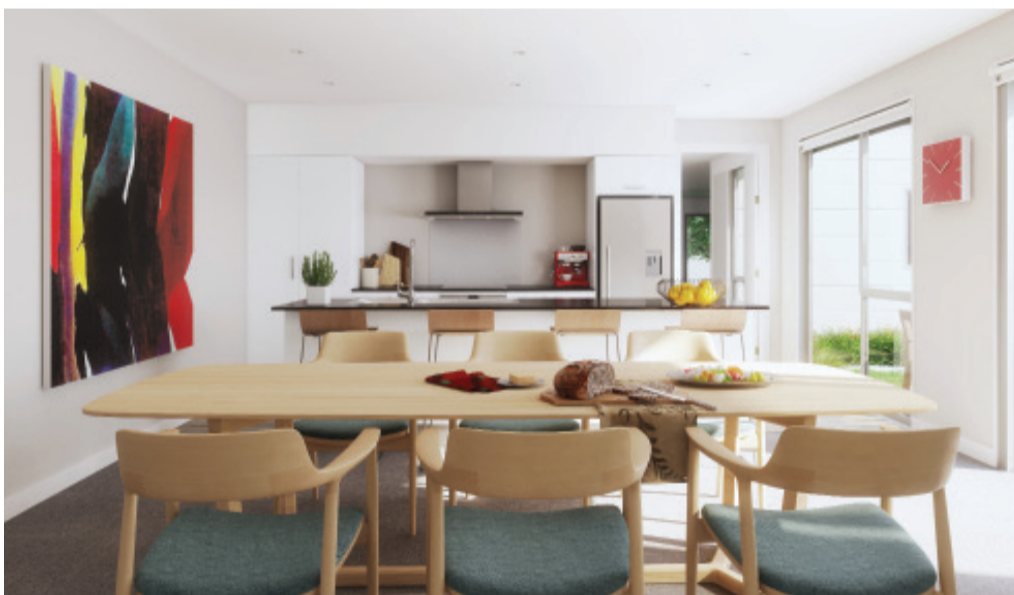
ARTIST IMPRESSION - Stand Alone Home Kitchen