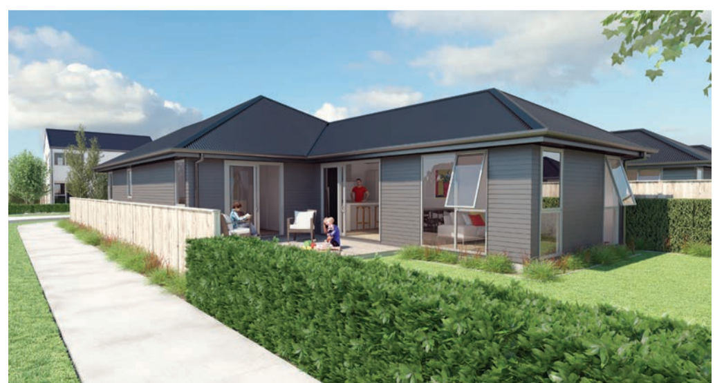
ARTIST IMPRESSION - Affordable Home Exterior