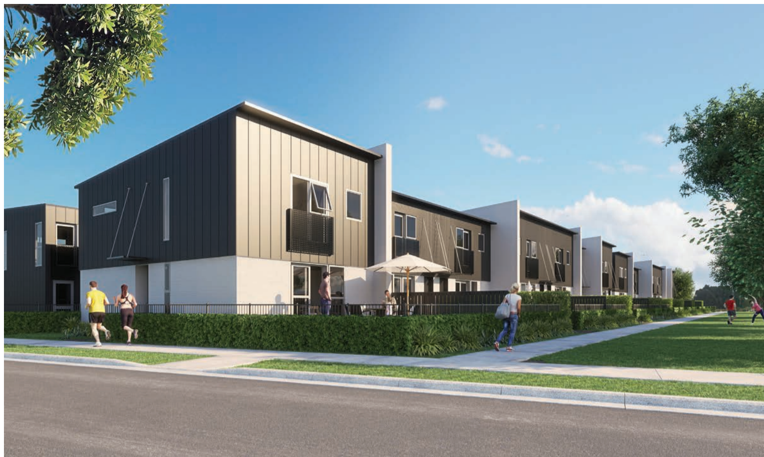
ARTIST IMPRESSION - Terrace Home Exterior

Bedroom sizes are spacious with built-in wardrobes. Quality flooring options throughout the terraces are in neutral tones to allow buyers to easily add their personal touch to the interior design.