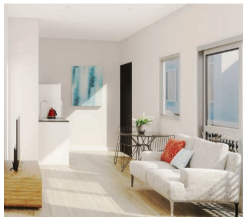
ARTIST IMPRESSION - "Fonzie" Flat Interior