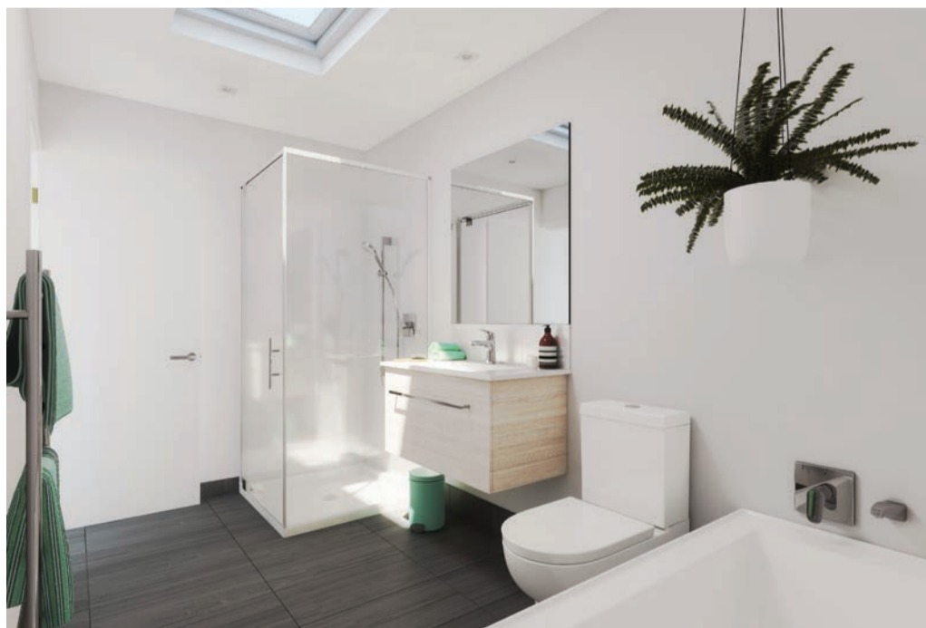
ARTIST IMPRESSION - Terrace Home Main Bathroom

We have a trusted reputation for designing and building high quality, low maintenance homes.