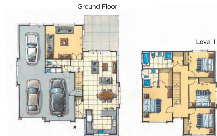
Artist's impression, minor changes may occur.

This home... offers ample living with a generous outdoor area for the family or the avid gardener.