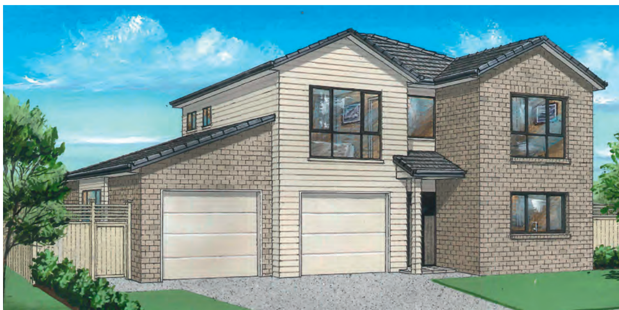
Artist's impression, minor changes may occur.

Available from Saturday, 29th April 2017, until sold on terms and conditions acceptable to the Vendor.