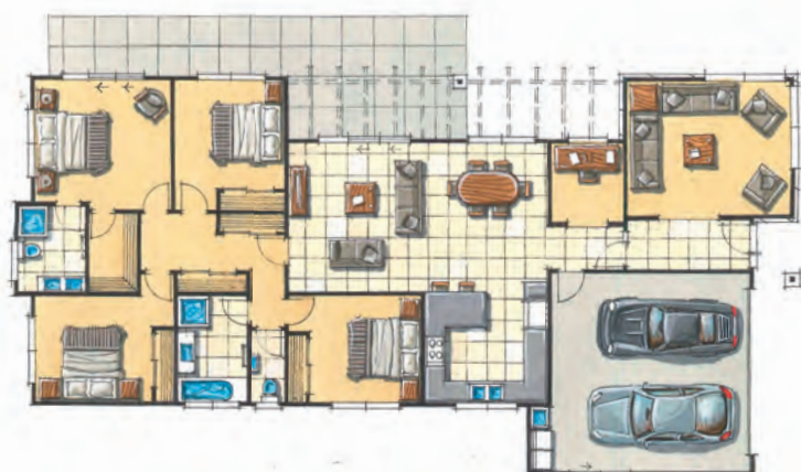
Artist's impression, minor changes may occur.

Available from Saturday, 13th May 2017, until sold on terms and conditions acceptable to the Vendor.