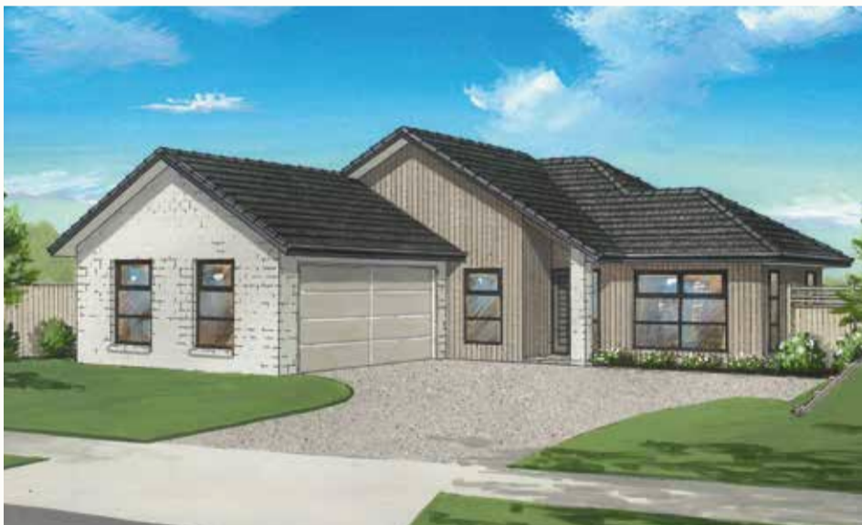
Artists impression, minor changes may occur