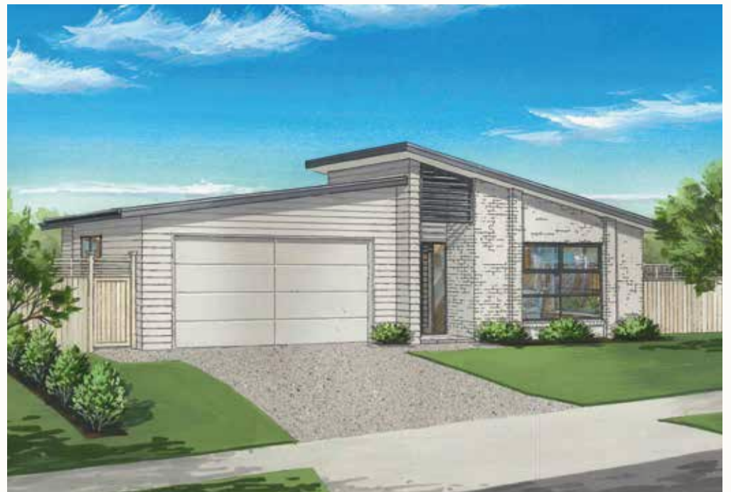
Artists impression, minor changes may occur

Ease of access from the living, dining to the large north facing patio sets the scene for seamless entertaining