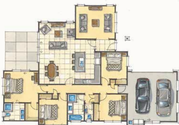
Artists impression, minor changes may occur

The island bench overlooking the family area is an ideal “gathering place” for the hub of family living allowing the busy chef to be part of it all