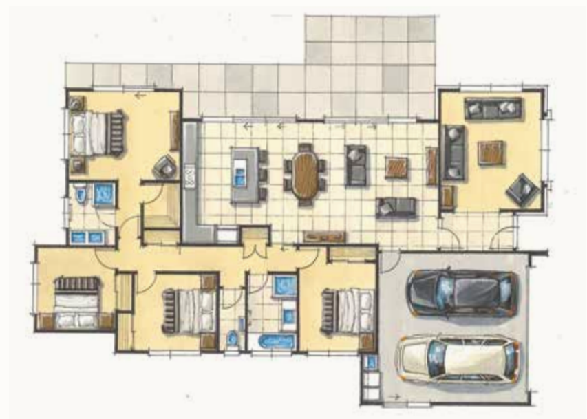
Artists impression, minor changes may occur