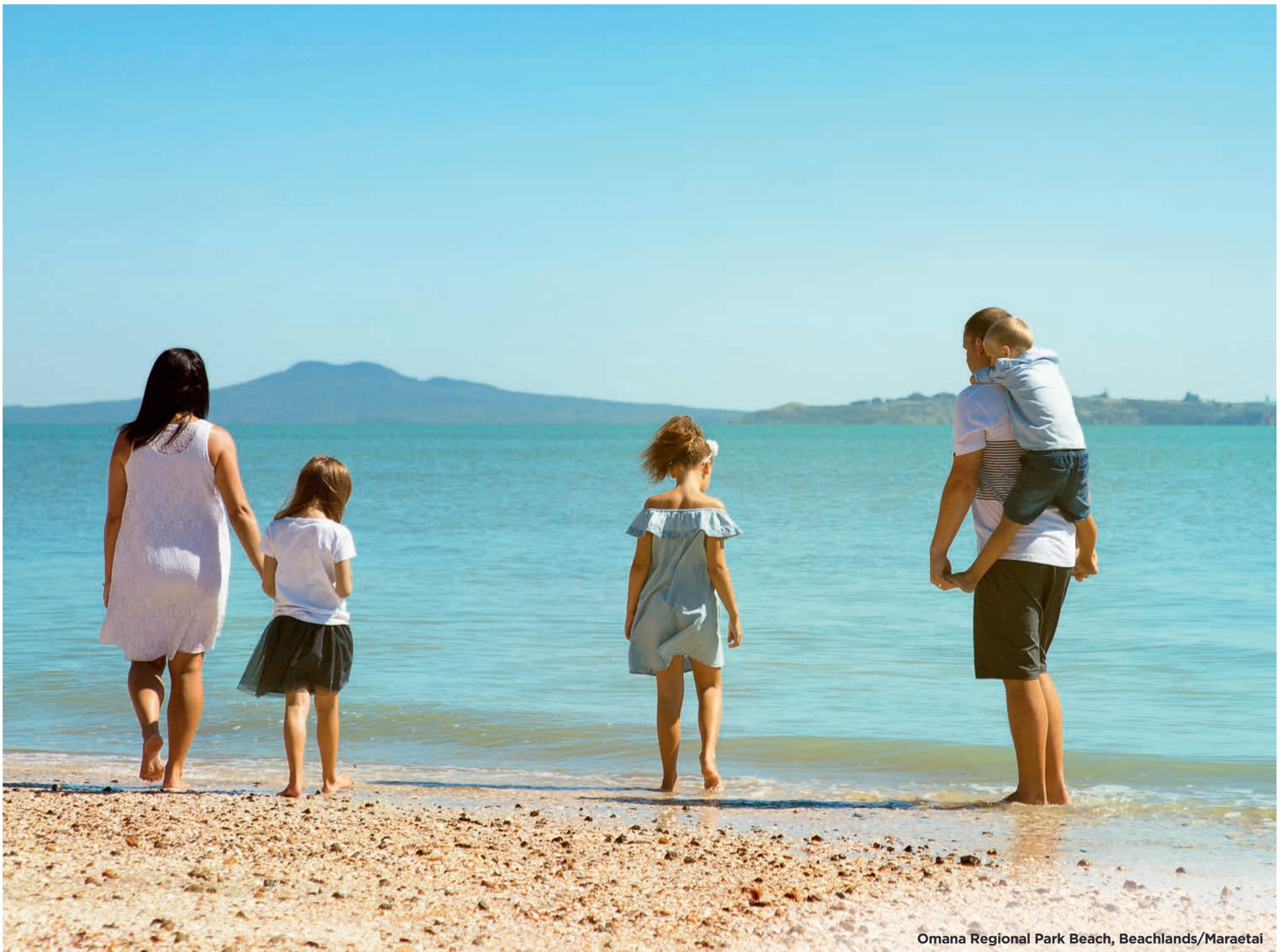
Omana Regional Park Beach, Beachlands/Maraetai

Beachlands is a tranquil coastal suburb nestled on Auckland's Pohutukawa Coast. Enjoy fresh sea air and stunning scenery from its coastal walkways and year round access to the sparkling waters of the Hauraki Gulf.