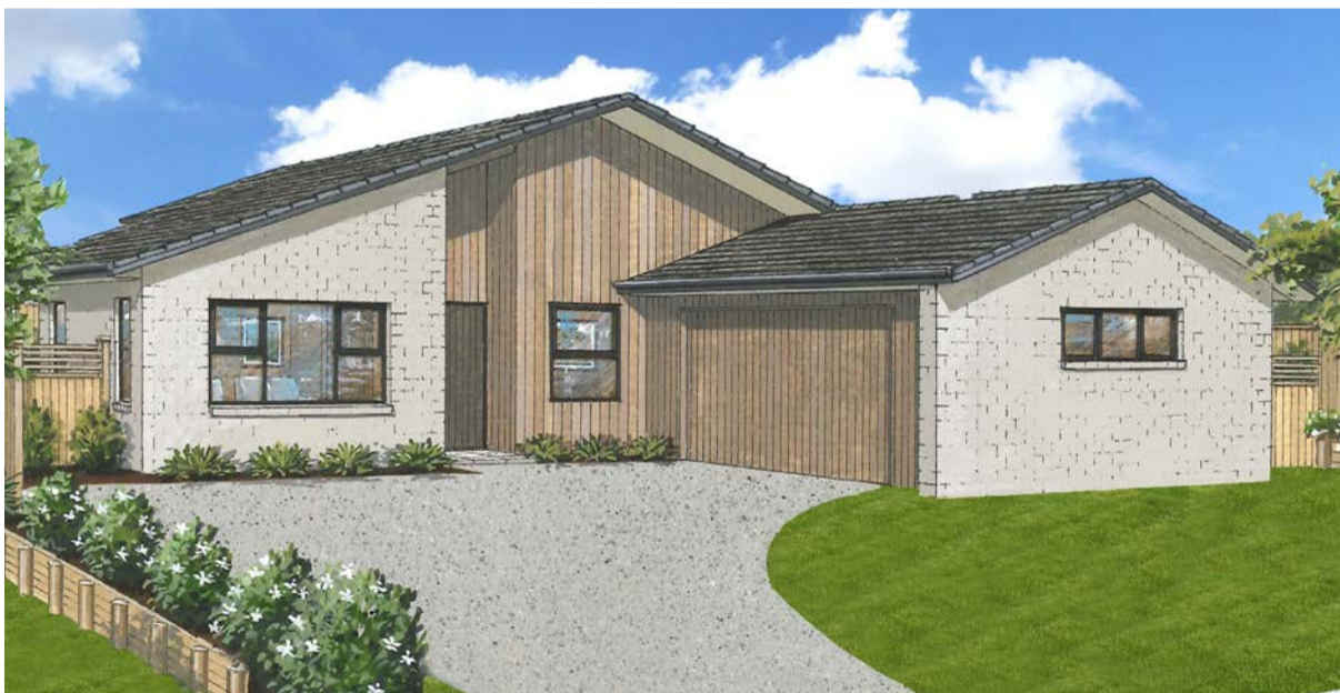
Artist's impression, minor changes may occur.