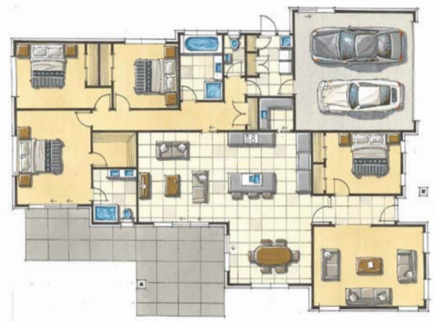
Artist's impression, minor changes may occur.

Experience a relaxed pace of life in this stunning 239m 2 home set on a 922m 2 site.