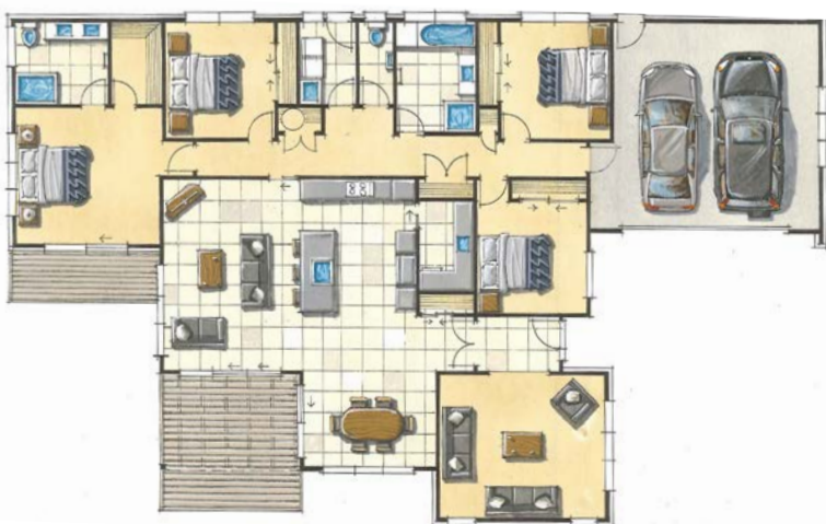
Artist's impression, minor changes may occur.

Available from Saturday, 22nd July 2017, until sold on terms and conditions acceptable to the Vendor.