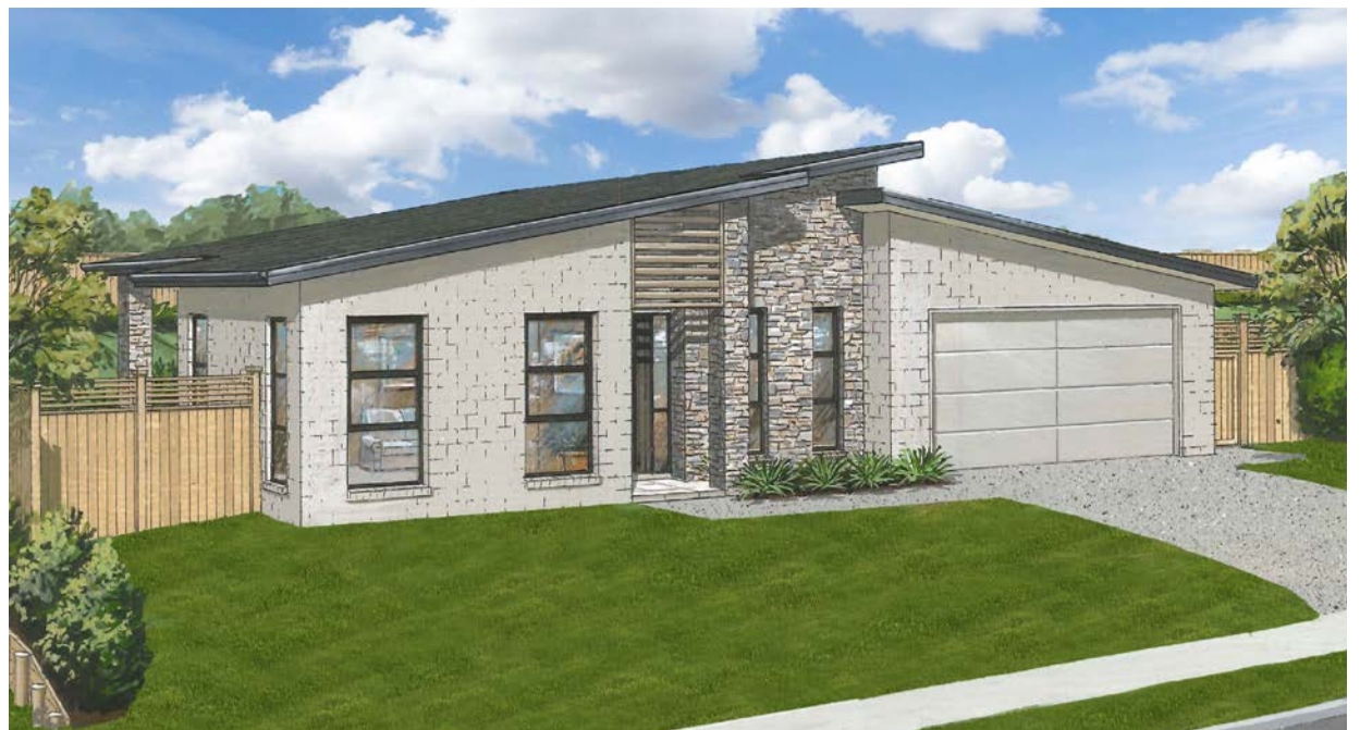
Artist's impression, minor changes may occur.

Available from Saturday, 15th July 2017, until sold on terms and conditions acceptable to the Vendor.