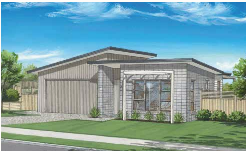
Artists impression, minor changes may occur