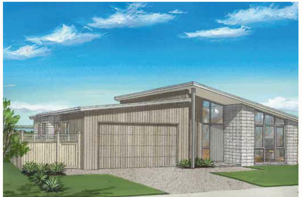
Artists impression, minor changes may occur

You will be wowed by the stunning views of the sparkling waters of the Hauraki Gulf and Rangitoto Island