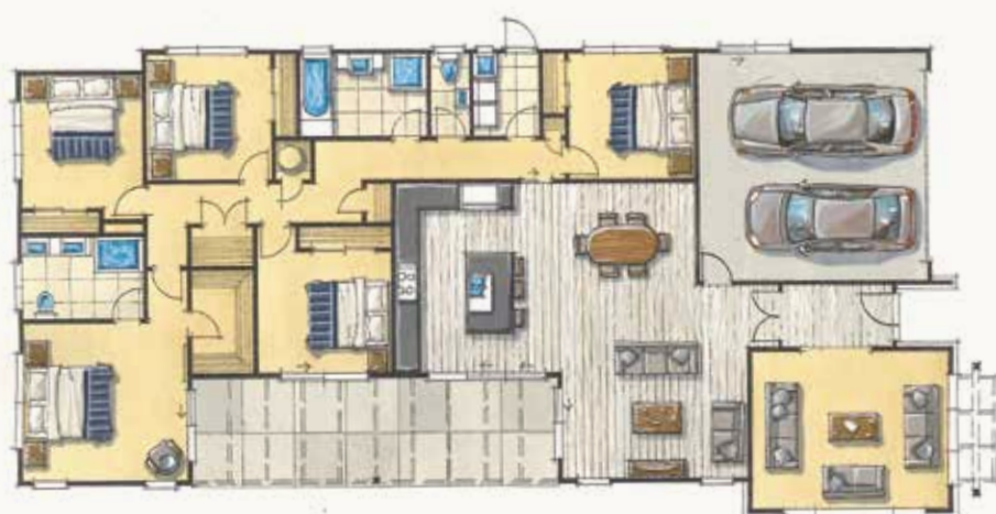
Artists impression, minor changes may occur

Available from 25th February 2017 until sold on terms and conditions acceptable to the Vendor.