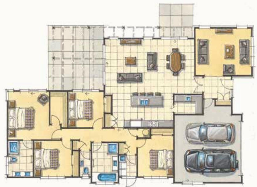
Artists impression, minor changes may occur