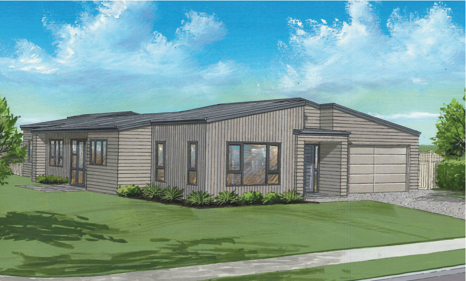
Artists impression, minor changes may occur