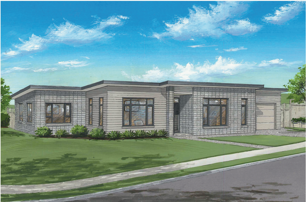
Artists impression, minor changes may occur

Easy indoor/ outdoor flow draw you to a north facing private patio where you can enjoy a summer barbeque with family and friends.